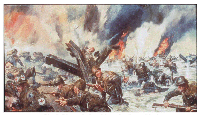
Normandy, 6 June 1944—Working Together, Fighting Together

At approximately 0600 on the dark gray morning of 6 June 1944, the first of several thousand men of the 29th Infantry Division fought their way onto the beaches of Normandy into the teeth of ferocious fighting. Helping to lead the way onto the European continent was the 116th Infantry Regiment of the Virginia National Guard. Although by this time a mix of active, reserve, and conscript officers and men, the 29th Division still retained its National Guard flavor and spirit. The division's leaders, still cognizant of their regiment's lineage dating back to the Stonewall Brigade of the Civil War, made sure that all newcomers—Regular Army, Organized Reserve, and draftees—knew it as well.