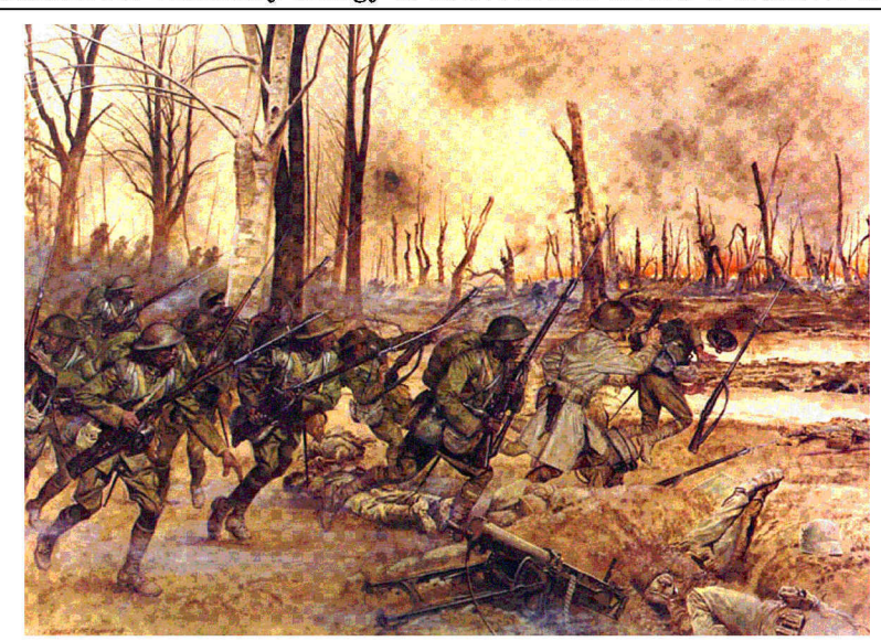
Meuse-Argonne, 26 September-1 October 1918

United States Army provided the land combat power necessary for the Allies to win World War I. The American Expeditionary Force, with many Leavenworth graduates among its leadership, won an important victory at Cantigny, won again in savage fighting in the Meuse-Argonne, and added the necessary energy to turn the tide on the Western Front.