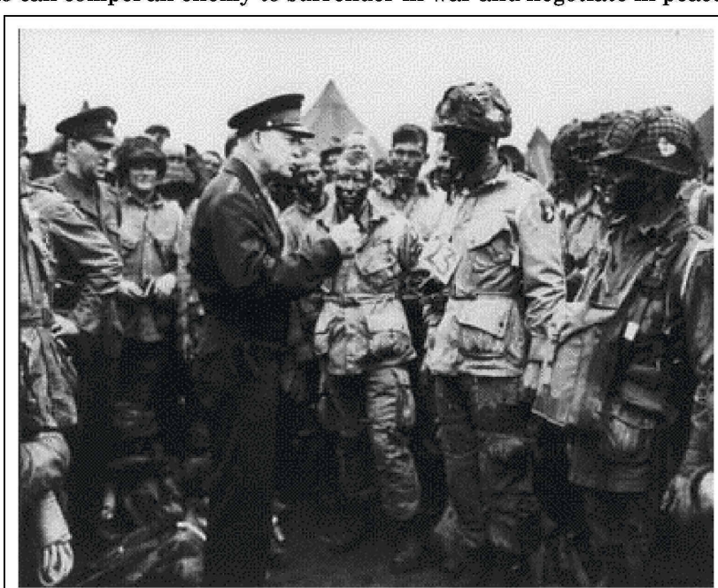
England, 5 June 1944

Today's environment demands more from Army leaders then ever before. The Army needs adaptive leaders—leaders that can successfully operate across the range of military operations. It needs adaptive leaders who can be home one day and, within hours, conduct military operations anywhere in the world. The Army needs adaptive leaders who can operate in all technological environments—from hand-to-hand combat to offensive information operations. Ultimately, The Army needs adaptive leaders who can compel an enemy to surrender in war and negotiate in peace.