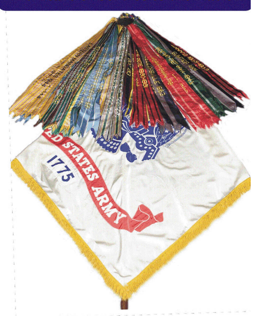
Persuasive in Peace, Invincible in War.